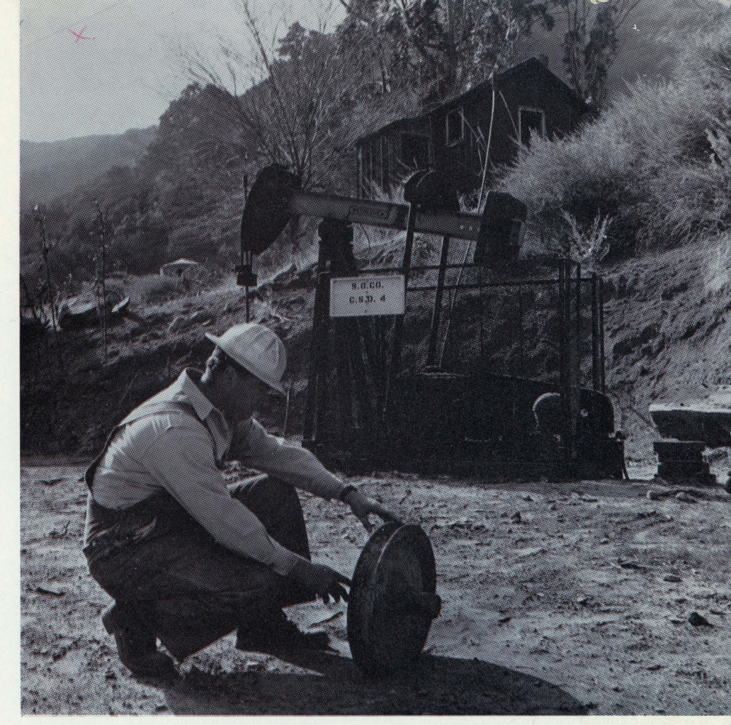
Guy Wiggins examines a cast iron sheave from an old crown block. That's C.S.O. (Pico) No. 4 in the background, still pumping away after 77 years of valiant service