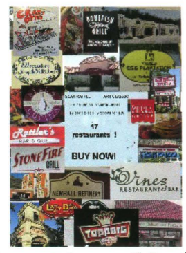
$5 per ticket or 5 for $20

3 Winners will be drawn today! Winners need not be present to win.